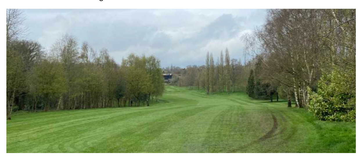
Hole 9 - Definition returning to the course.