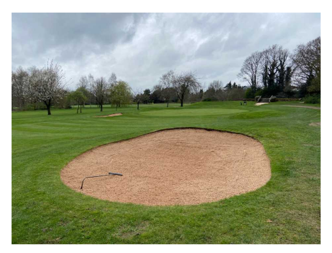
Please leave the entire rake in the bunker as shown in the image above